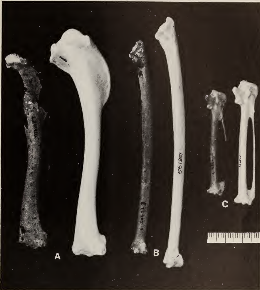
Fig. 3. Wing elements of Geronticus apex sp. nov., holotype, SAM-PQ-L20692 (on left in each pair) and G. eremita , MVZ 155199. A. Humeri. B. Ulnae. C. Carpometacarpi. Scale is in mm.

and posteriorly). Mandibular symphysis narrow as in G. eremita , not broader and more flattened as in G. calvus . Compared to modern species of Geronticus , the procoracoid foramen of the coracoid is smaller, the brachial depression of the humerus is smaller, not extending as far proximally, with the brachial depression of the ulna being correspondingly small; the trochanter of the femur in lateral view is more proximally extended into a point, appearing narrower and less truncate. The wing elements are proportionately longer than in G. calvus , being more similar to those of G. eremita .